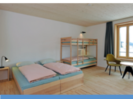
St. Moritz Youth Hostel,

with a double and a bunk bed with shower/WC