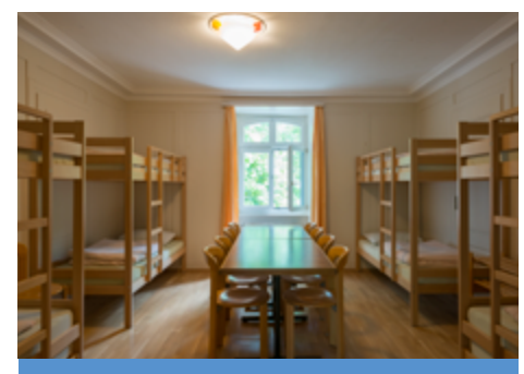
Schaffhausen Youth Hostel, Dormitory

with shower/WC or showers/WC on every floor